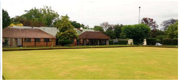
The Sedibeng under-15 Juniors, above left, Henley on Klip Bowling Club House, above right