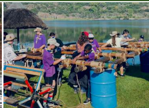
Above left, Henley's Scouts out on the water at Bass Lake Adventures, above right, team work at it's finest